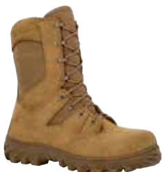
S2V PREDATOR - p.37