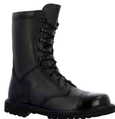
JUMP BOOT - p.40