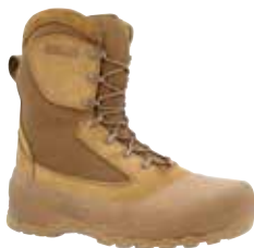
BRT - p.39